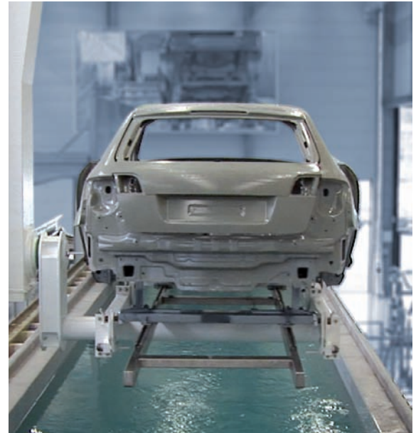
EPD painting process