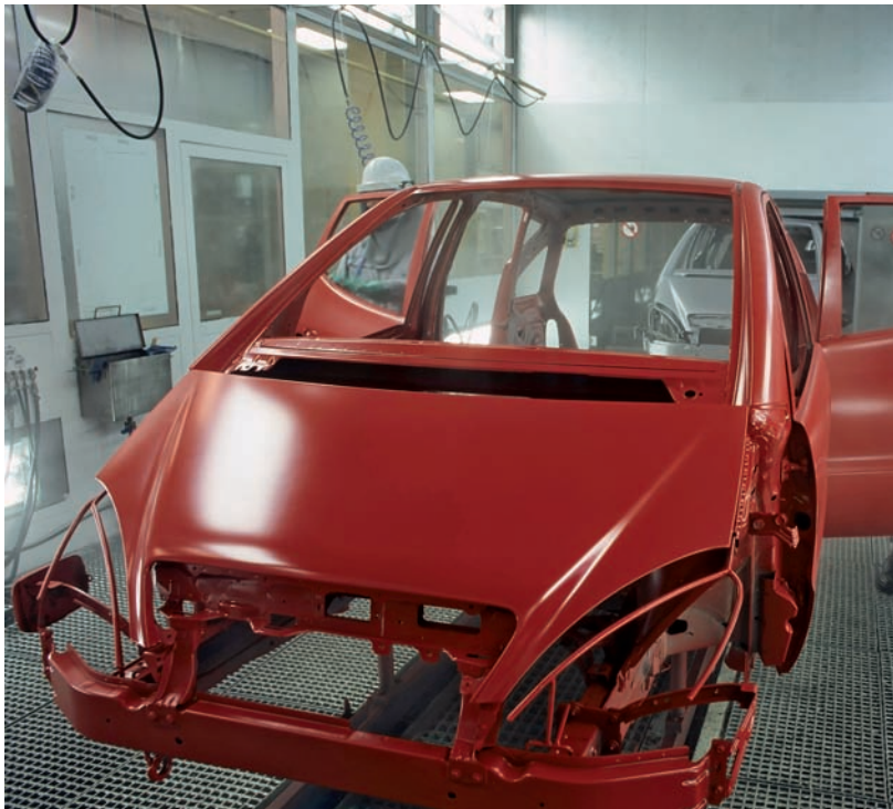
Car body after the painting process